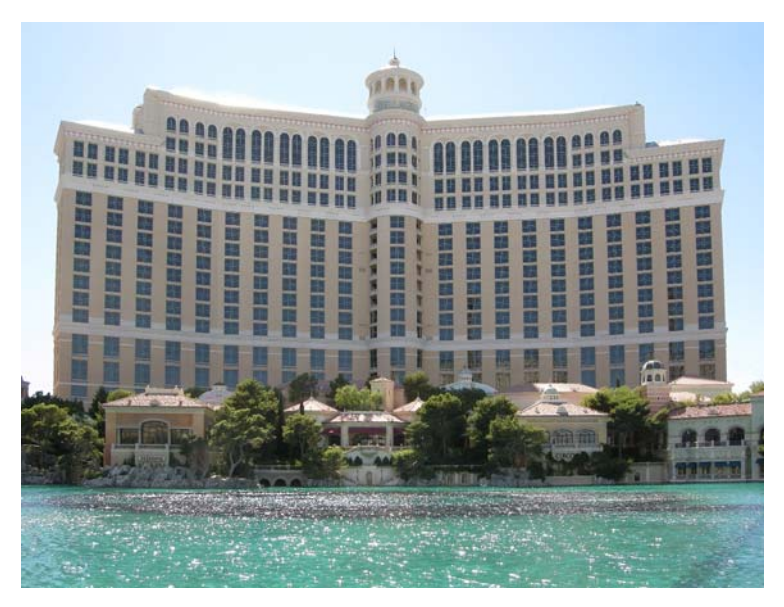
Figure 2. How many stories there are in Bellagio Hotel

Let's return to Criss Angel and Las Vegas. Here is another illusion for you. Take a look at the picture of the Bellagio Hotel and guess how many stories there are (Figure 2). Commonly, people estimate that it has about 20 stories, which is precisely what the architect wants us to believe. The actual number is 36.